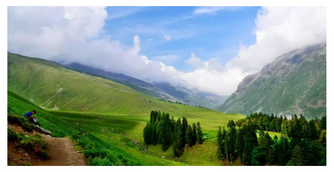
Book Your Cab For Chail

Located close to Shimla, Chail is known for having world's highest cricket and polo grounds, blooming at an altitude of over 2400 meter. Chail is visited by many hikers all over the year. It has good trekking points from Junga, Kufri and Ashwani Khad at Solan. Many Eco camps are held here. There are many camping sites for campers and hikers, so camping in Chail is most sought after activity for enthusiasts. This makes Chail an ideal destination for all kind of travellers, ranging from family vacations to adventure lovers.